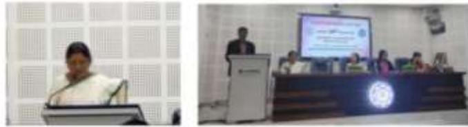
Photo 4: Glimpses of the Program