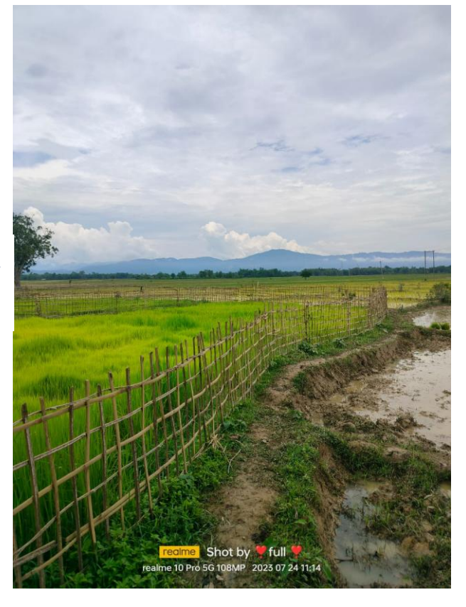
Photo clicked by Indreswar Chutia of UG 5<sup>th</sup> semester (Geography department), awarded 2<sup>nd</sup> position in the competition