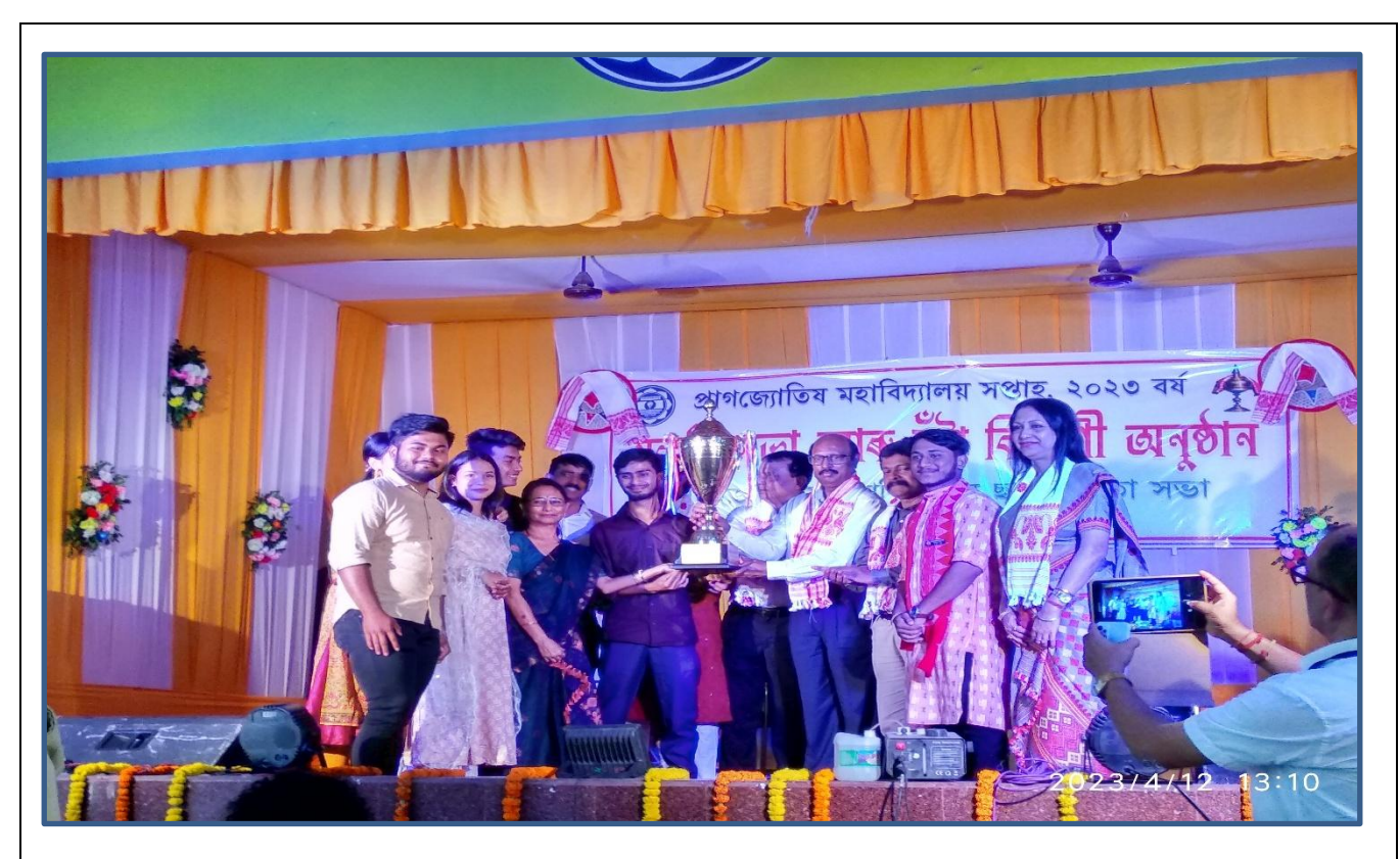
The department received the 2^{nd} prize in Cultural Rally in the college week prize distribution ceremony