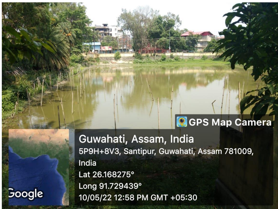
Open Water Tank