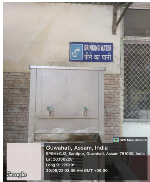
Purified Drinking Water Plant