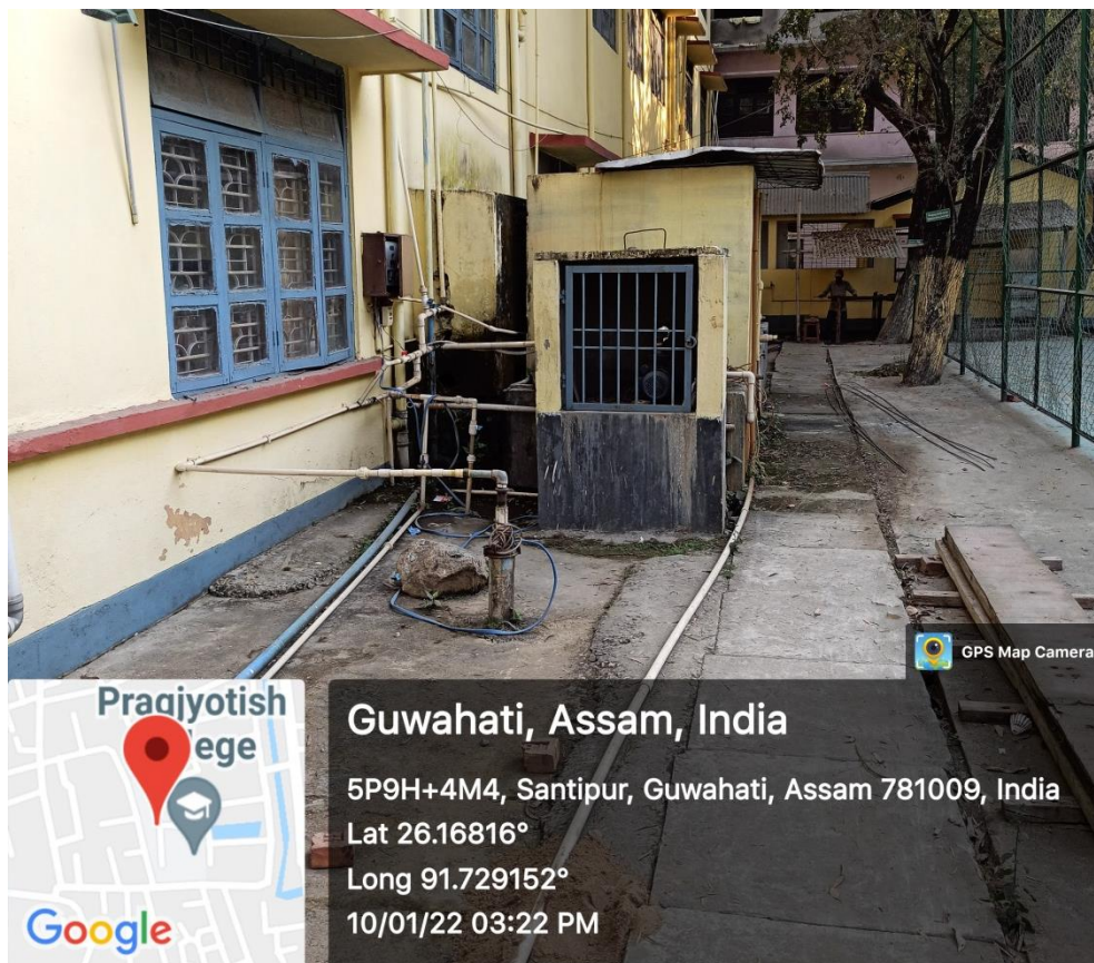
Water Distribution system