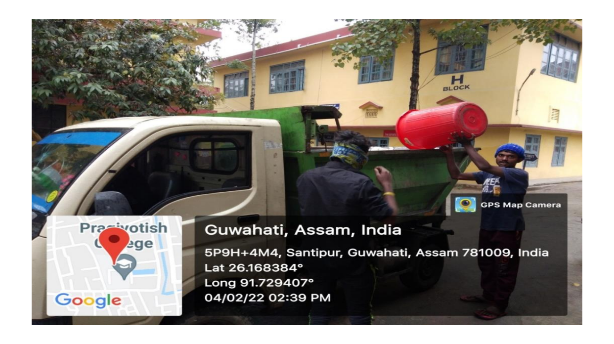
GMC GARBAGE COLLECTING VAN