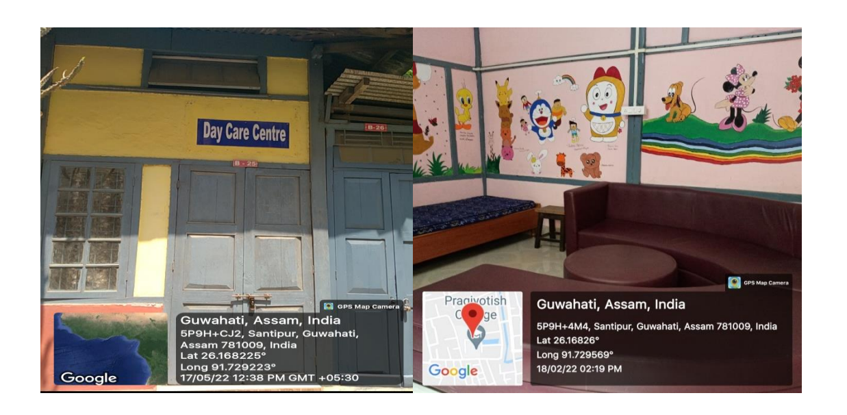
DAY CARE CENTRE