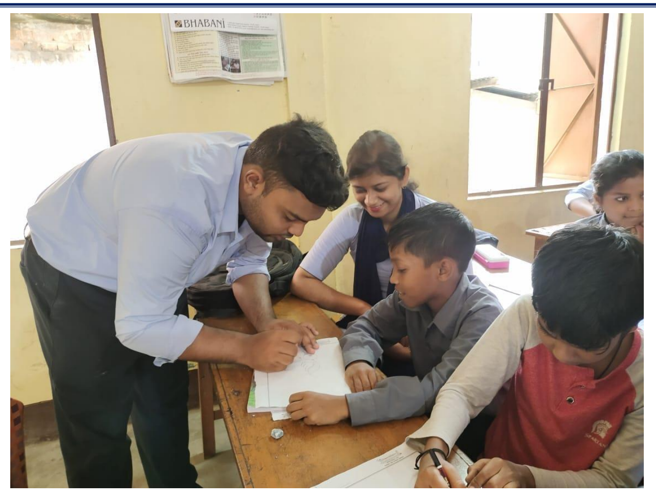
Field study & Interactive session

E-mail: principal@pragjyotishcollege.ac.in Website: www.pragjyotishcollege.ac.in