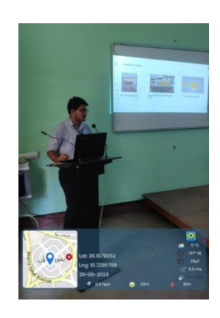
Workshop on "Implementation of ICT in Geosciences" organized by Geology Department