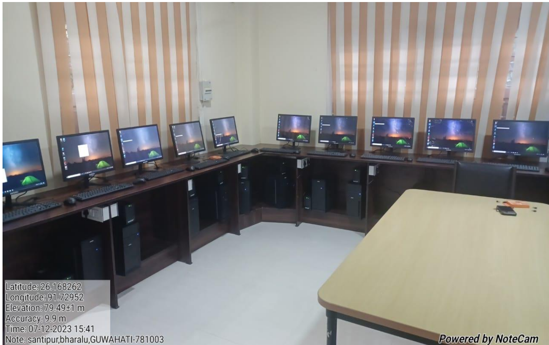
RFID Library Attendance System

Latitude: 26.168262 Longitude: 91.72952 Elevation: 79.49±1 m Accuracy: 9.9 m Time: 07-12-2023 15:41 Note: santipur,bharalu,GUWAHATI-781003