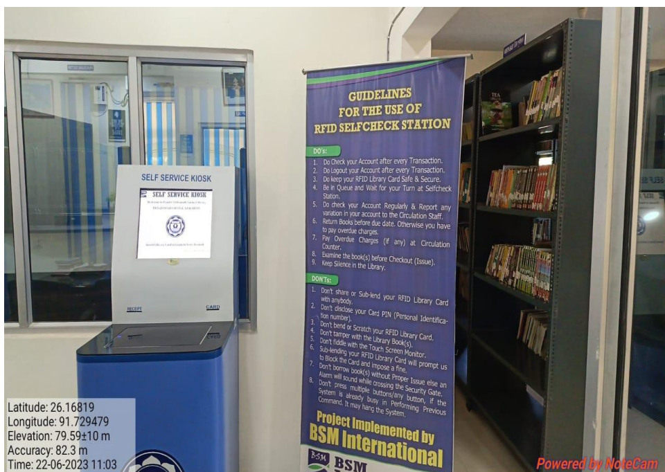
Self Service Kiosk