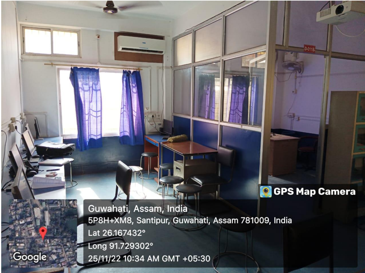
COMPUTER LABORATORY(PHYSICS DEPARTMENT)

E-mail: principal@pragjyotishcollege.ac.in Website: www.pragjyotishcollege.ac.in