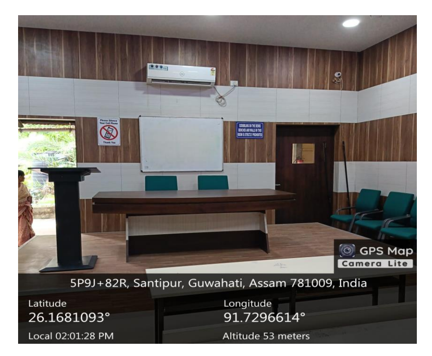
SEMINAR HALL OF ASSAMESE DEPT

E-mail: principal@pragjyotishcollege.ac.in Website: www.pragjyotishcollege.ac.in