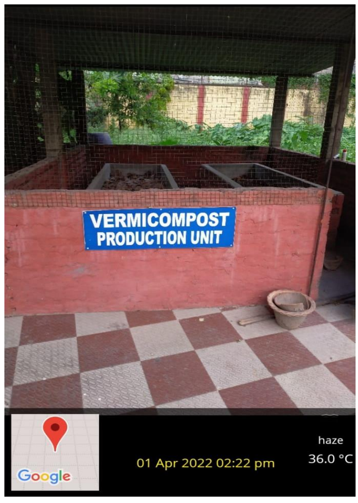
Maintenance of the college campus