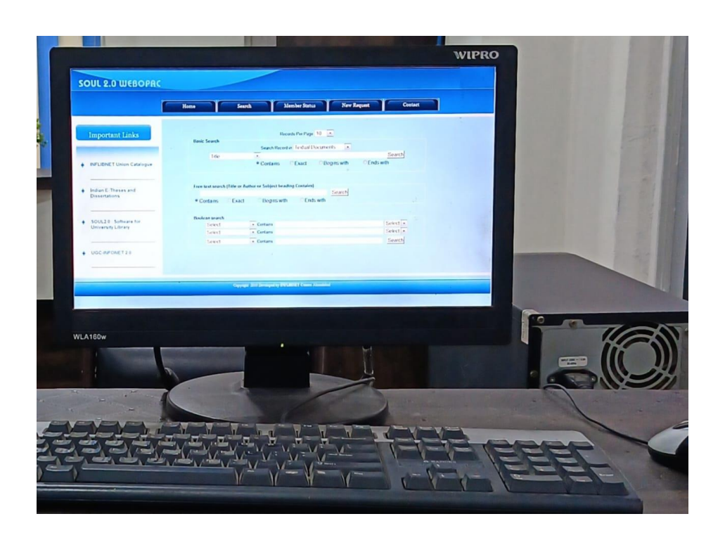
SOUL 2.0 WEBOPAC