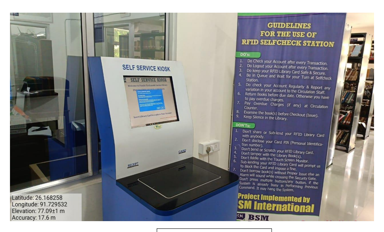
Self Service Kiosk