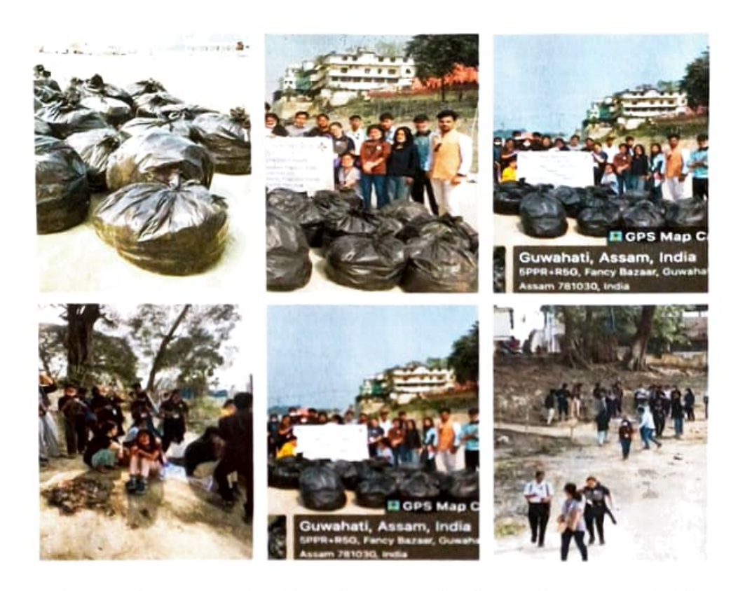
D. Environment Day Celebration at Adopted School "Pragati Pathshala Primary School"

The Department of Geography, in collaboration with student organization "Xhipa" and the Bharat Scouts and Guides Unit, organized a river bank cleanliness drive at Lachit Ghat. Students from various departments actively participated in this initiative to promote environmental conservation.