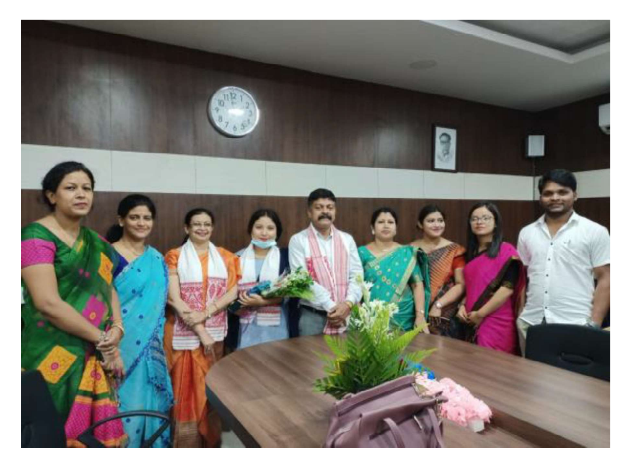
Resource person along with principal and faculties of education department

The session was beneficial for the participants and they could learn various aspects of research and its importance towards the society and mankind. There was a doubt clearing session at the end of the program and all the queries of the students were properly resolved and the cloud of doubt from their minds was removed.