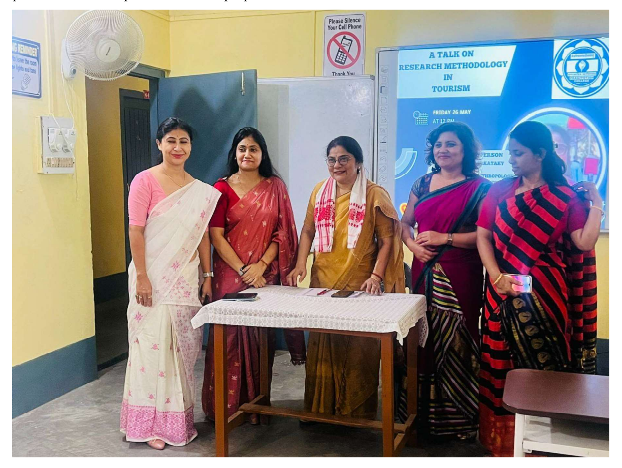
Faculties of MTM with resource person

Outcome of the Activity/Event : Students got the knowledge from an experienced learned resource person and developed the skills to prepare their Dissertation.