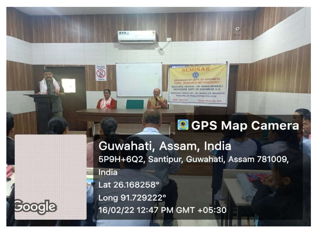
Principal along with Resource person and HoD of Assamese department sharing the dais