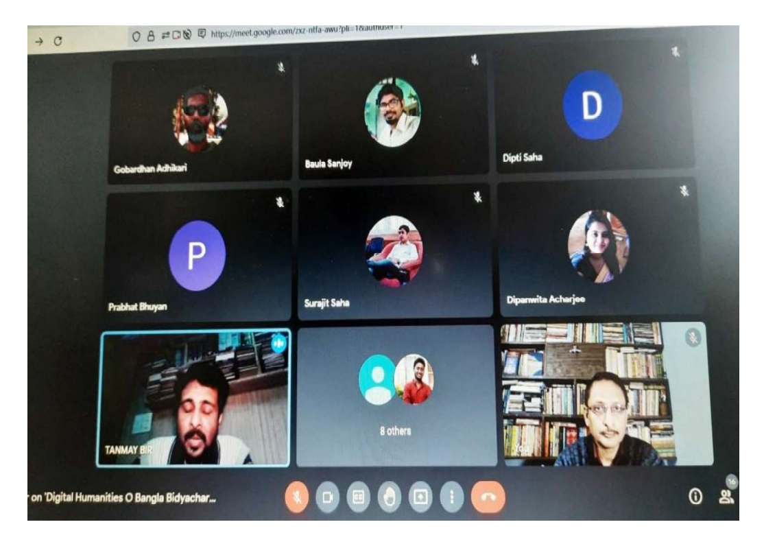
Screen shot of the online webinar showing the participants from different region