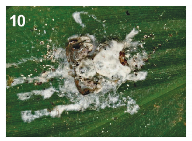
Figs. 6–10. Phrynarachne decipiens (Forbes 1884). 6, cleared epigyne, dorsal view; 7, same, ventral view; 8, diagrammatic representation of epigyne, dorsal view; 9, diagrammatic representation of epigyne, ventral view; 10, Resting position with silk deposited on leaf mimicking bird droppings. Scales = Figs. 6–9 (0.5 mm).