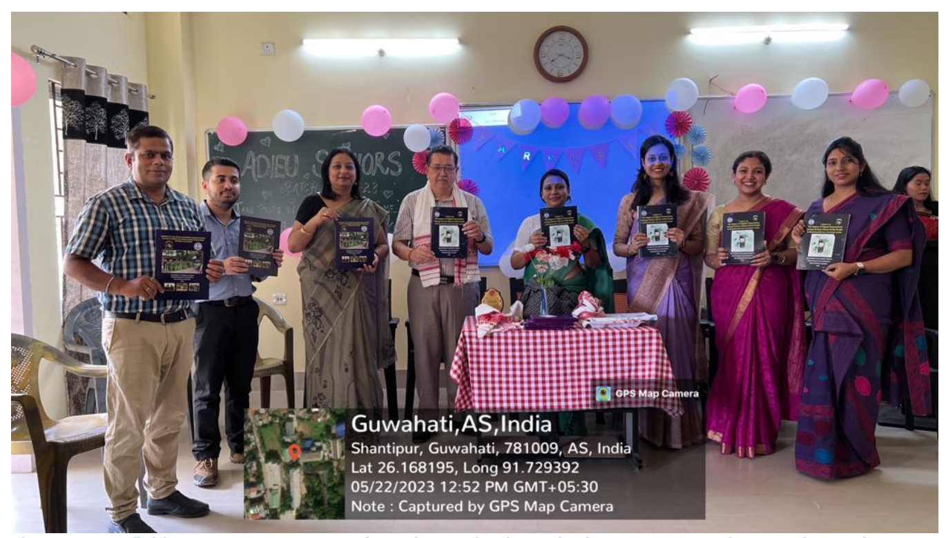
Figure 2: Two field survey Reports were released on 22/05/2023 in the Department of Economics on the occasion of the Farewell Function of the UG 6th students. The Best Attendance Award was conferred to the three students of each semester. Appreciation Certificate