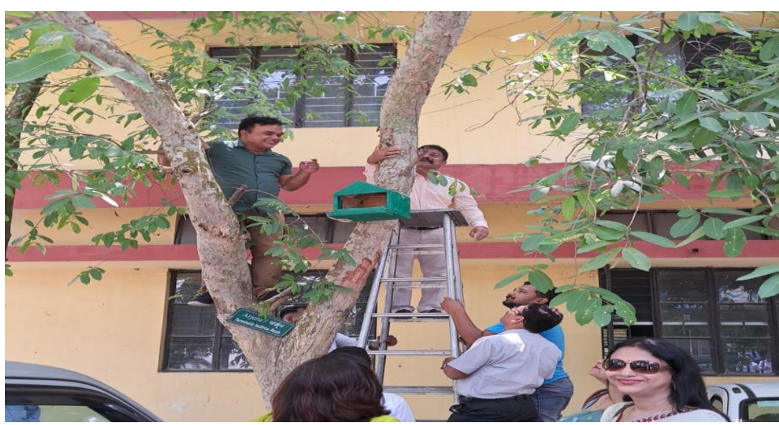
Figure 3: World Environment Day